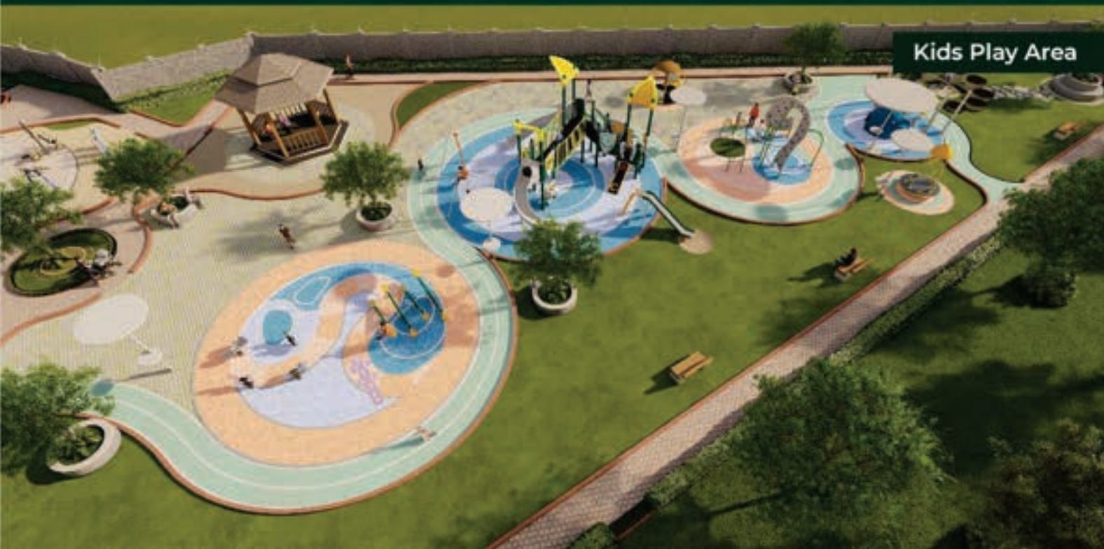
Kids Play Area