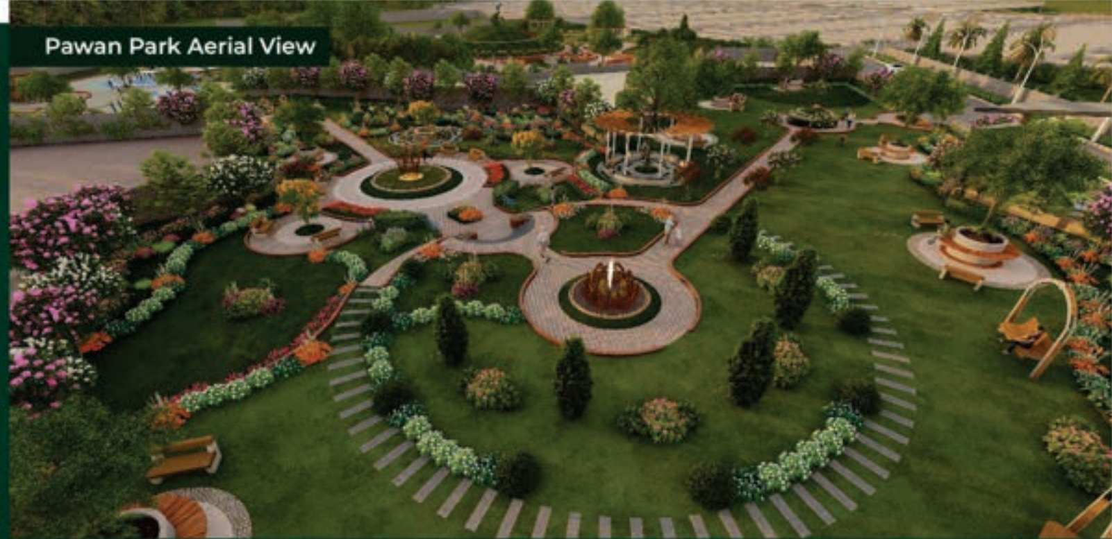
Pawan Park Aerial View